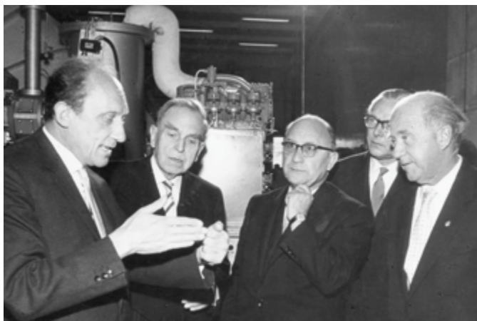
Inauguration of the tandem accelerator at the MPI for Nuclear Physics in Heidelberg, 1962.

been a member of the NSDAP, 116 but he denied his party membership after 1945. 117 Despite several invitations, 118 he never visited Israel himself nor became involved in Weizmann Institute events abroad. In 1970, the Science Attaché of the Israeli Embassy in West Germany considered Butenandt as “unsuitable for a visit because of his behavior during the NS period.” 119