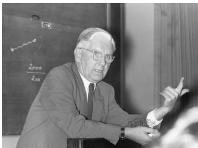
Herman F. Mark at the Fritz Haber Institute of the MPG, Berlin, 1954.